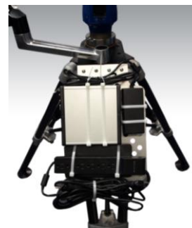
Hardware Mounting Plate (on back of tripod)