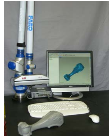
Laser Design Faro System with SLP 2000

SLP laser probes interface to PCs using a standard USB connection. A high-end PC with ample memory, Windows XP or XP 64 and a high-end Open GL graphics video card are recommended. SLP Laser Probes are interchangeable with the RPS probes on most LDI Surveyor Scanning Systems. The Geomagic software "Plug In" interface is also provided for Faro Arms and some SURVEYOR Systems.