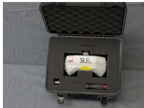
SLP Laser Probe Carrying Case and Tools