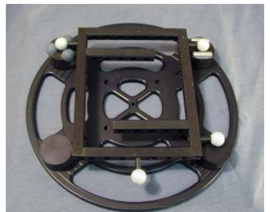
Specifications subject to machine installation by authorized LDI technician only. February 11, 2008.